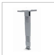
T-Clip Support Bracket

Please be aware that the loading capacity of the Superlight SL8330 wardrobe rail can be compromised by overloading with hanging clothing articles, potentially resulting in unwanted flex. To ensure optimal rigidity and stability, it is advisable to assess the total weight of the intended load and consider the installation of mechanical support accessories, such as T-Clip and S-Clip support brackets (sold separately), if necessary.