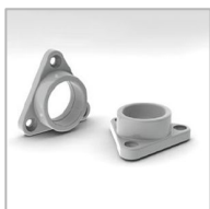
Wall Bracket Kit