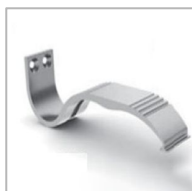
S-Clip Wall Support