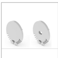
End Caps (kit 2pcs)